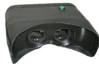
MorphoTrust™ Mobile Eyes

Offender ID is bolstered by the dual, back-end support of the ABIS Search Engine and ABIS Identity Manager when used as a standalone system. The Search Engine quickly and accurately performs biometric matching, while Identity Manager retains and updates inmate information in an encounter-based system. Operators are able to effectively mine, manage and audit subject data as well as manage users, roles and lists in real time.